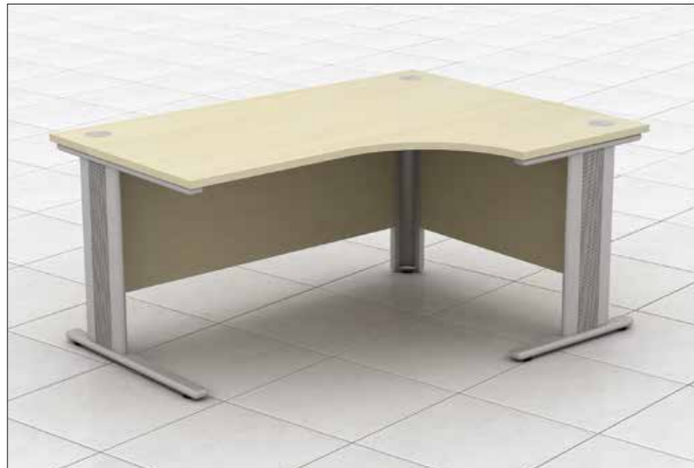
Straight Modesty Panel

Qudos desking is available with a choice of 2 modesty panels