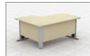
Concave Modesty Panel