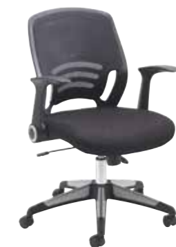
CARBON // CH1730