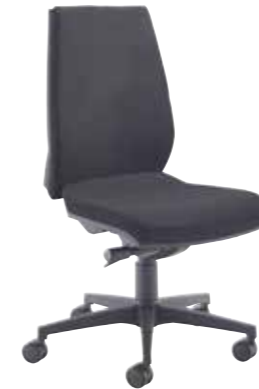
FABRIC HIGH BACK // CH2732