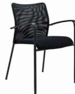
START VISITOR // CH1742