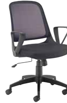
TASK MESH // CH3731