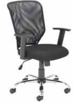
START MESH // CH1743