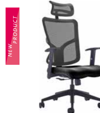
KEMPES // CH0780