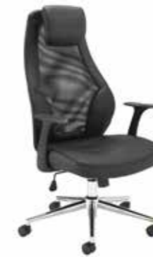
FONSECA // CH2403