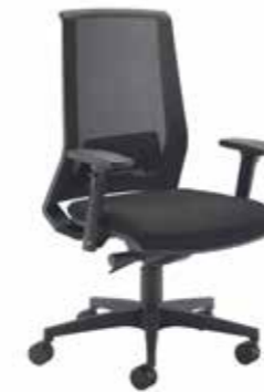
MESH + ADJUSTABLE ARMS // CH2730 + AC2730