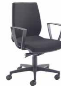
FABRIC MID BACK + FIXED ARMS // CH2733 + AC2731