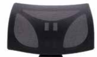
STEALTH HEADREST // AC2600