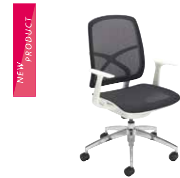
ZICO // CH0799