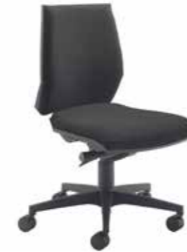
FABRIC MID BACK // CH2733