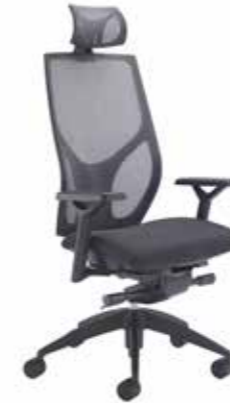
STEALTH EXECUTIVE // CH2600 + AC2600