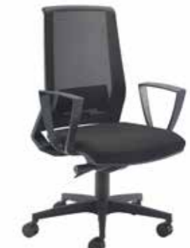
MESH + FIXED ARMS // CH2730 + AC2731