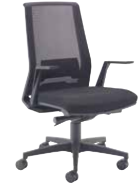
MESH + FIXED ARMS // CH2730 + AC2732