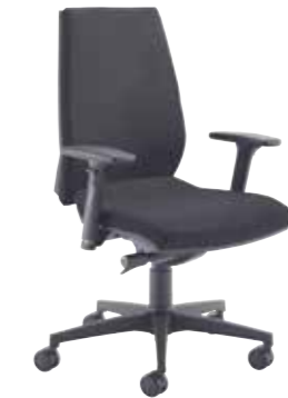
FABRIC HIGH BACK + ADJUSTABLE ARMS // CH2732 + AC2730

Band 0: £338.00 Band 1: £343.00 Band 2: £349.00 Band 3: £354.00 Band 4: £361.00 Band 5: £369.00 Band 6: £381.00