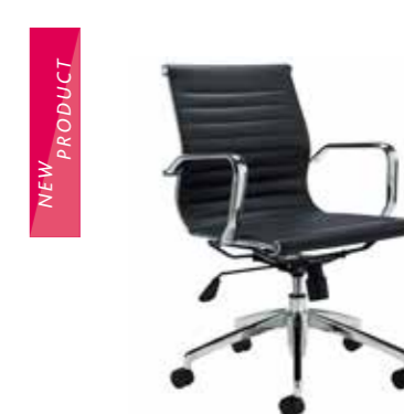
SOSA // CH1249