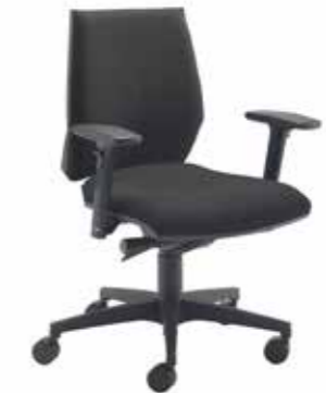
FABRIC MID BACK + ADJUSTABLE ARMS // CH2733 + AC2730