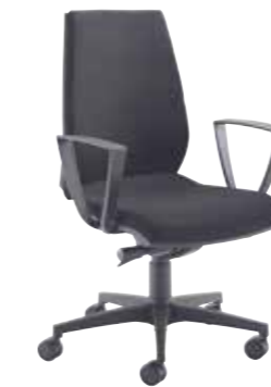
FABRIC HIGH BACK + FIXED ARMS // CH2732 + AC2731