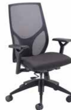
STEALTH // CH2601