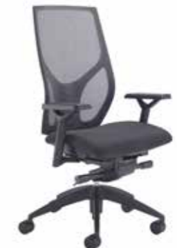
STEALTH MANAGER // CH2600