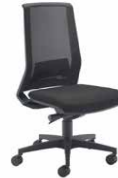
MESH // CH2730