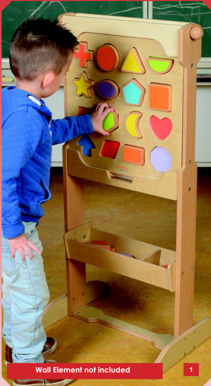
Wall Element not included