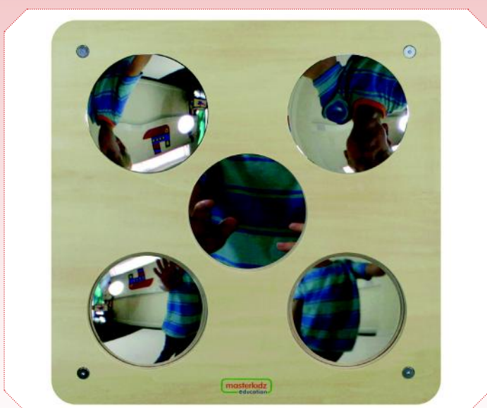
C5219 - Fun Mirror