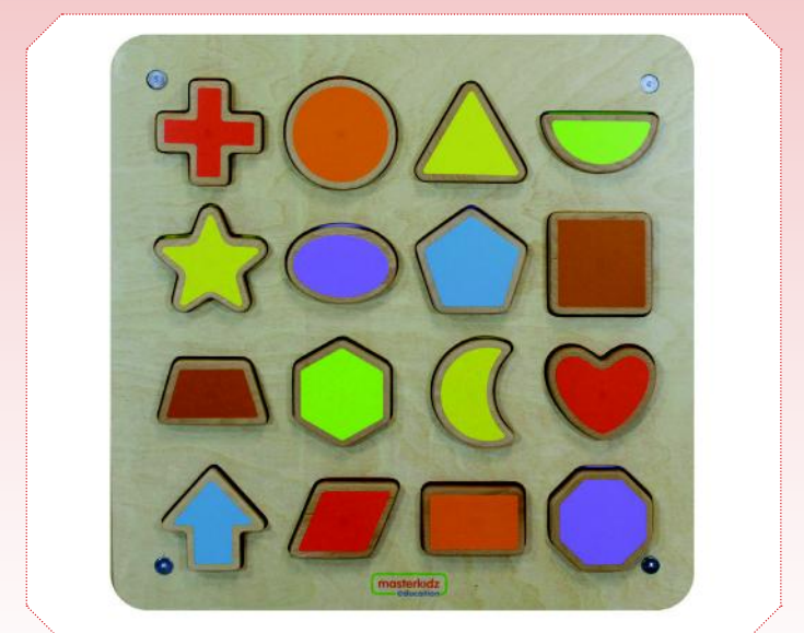
C5218 - Magnetic Shape Matching