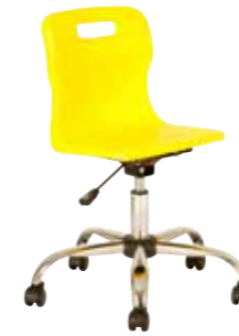
T30 - JUNIOR SHELL AGES 5 - 11