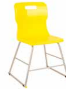
T60 - SIZE 3 AGES 5 - 7