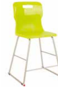
T61 - SIZE 4 AGES 7 - 9