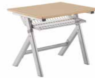
T50 - SQUARE