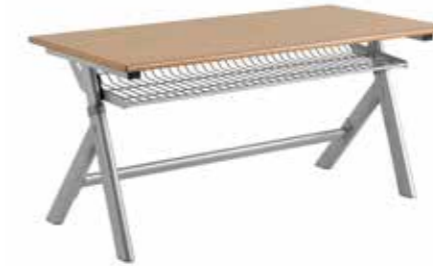
T55 - RECTANGULAR