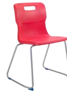
T26 - SIZE 6 AGES 13+