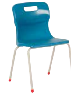
T14 - SIZE 4 AGES 8 - 9