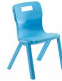
T2 - SIZE 2 AGES 3 - 4