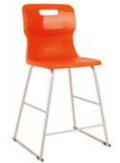
T62 - SIZE 5 AGES 9 - 13