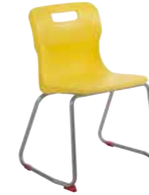
T24 - SIZE 4 AGES 7 - 9