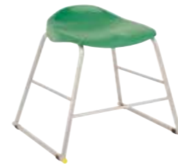
T90 - SIZE 3 AGES 5 - 7