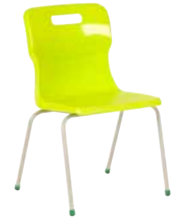
T15 - SIZE 5 AGES 9 - 13