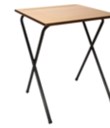
TC66ED-PREM-720 - EXAM DESK MDF

TC66ED-PREM-720 // D600 W600 H720 RRP: £35.00