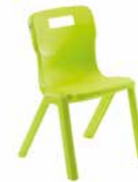
T1 - SIZE 1 AGES 1 - 2