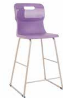
T63 - SIZE 6 AGES 13+