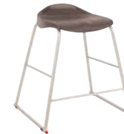
T91 - SIZE 4 AGES 7 - 9