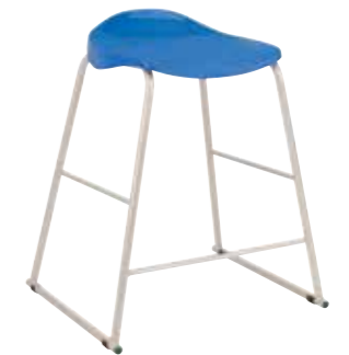
T92 - SIZE 5 AGES 9 - 13