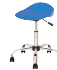
T33 - SENIOR STOOL AGES 11+