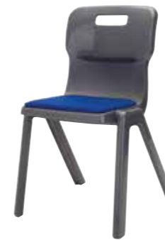
T8 - FABRIC SEAT PAD

A range of accessories for the Titan range to suit your needs. Just like our furniture, all of our products are made from ultra-durable materials and designed to improve the functionality of our range. All of our accessories are custom designed for Titan products.