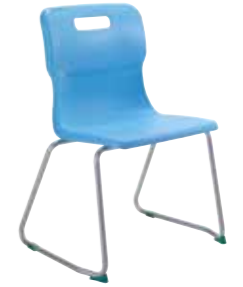
T25 - SIZE 5 AGES 9 - 13