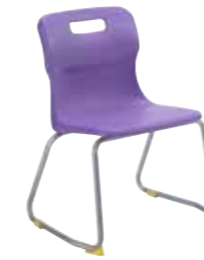
T23 - SIZE 3 AGES 5 - 7