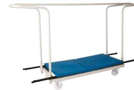
T10-T - EXAM DESK TROLLEY

RRP: £350.00 Overall dimensions: D1225 W660 H1150 Desk capacity: 20 Titan exam desks