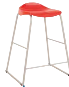
T93 - SIZE 6 AGES 13+