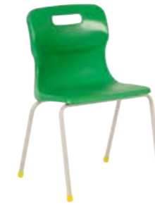
T13 - SIZE 3 AGES 5 - 7