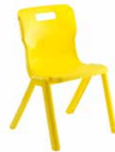
T4 - SIZE 4 AGES 8 - 9