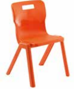
T3 - SIZE 3 AGES 5 - 7