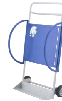
T40 - TROLLEY

RRP: £300.00 Overall dimensions: D480 W650 H1158 Capacity: 15 Chairs