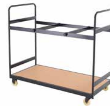
TCEDT-UNI - EXAM DESK TROLLEY

RRP: £350.00 Overall dimensions: D1225 W660 H1150 Desk capacity: 20 Titan exam desks