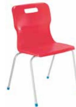
T16 - SIZE 6 AGES 13+