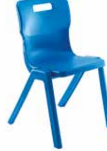
T5 - SIZE 5 AGES 9 - 13