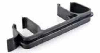
T7 LINKING CLIP