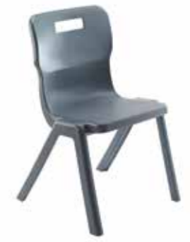
T6 - SIZE 6 AGES 13+