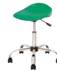
T32 - JUNIOR STOOL AGES 5 - 11