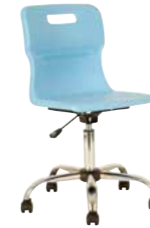
T35 - SENIOR SHELL AGES 11+