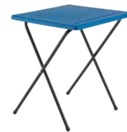
T10 - EXAM DESK