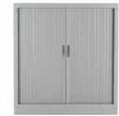
380MM DEEP - 1M HIGH