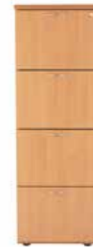
4 DRAWER FILING CABINET TES4FC // W464 D600 H1365 £410.00