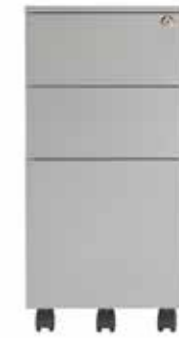
SLIMLINE MOBILE PEDESTAL