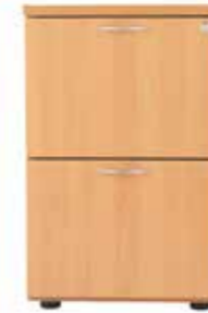
2 DRAWER FILING CABINET TES2FC // W464 D600 H710 £305.00

Our filing cupboards are compatible with all Start, One and Bench workstations ranges. With 2 drawer, 4 drawer, heavy duty side filing options and 6 colour finishes, we have the answer for any storage requirement.