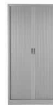
380MM DEEP - 1.95M HIGH

To hide years of paperwork, a steel tambour could be exactly what you need. With flexible storage, adjustable shelves and a simple click and fit construction, this will become an essential in the office.