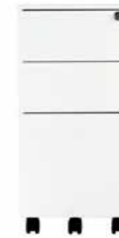
SLIMLINE MOBILE PEDESTAL