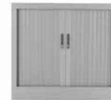
380MM DEEP - 730MM HIGH