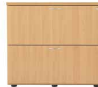
HEAVY DUTY SIDE FILER TKDH800SF // W800 D600 H730 £565.00