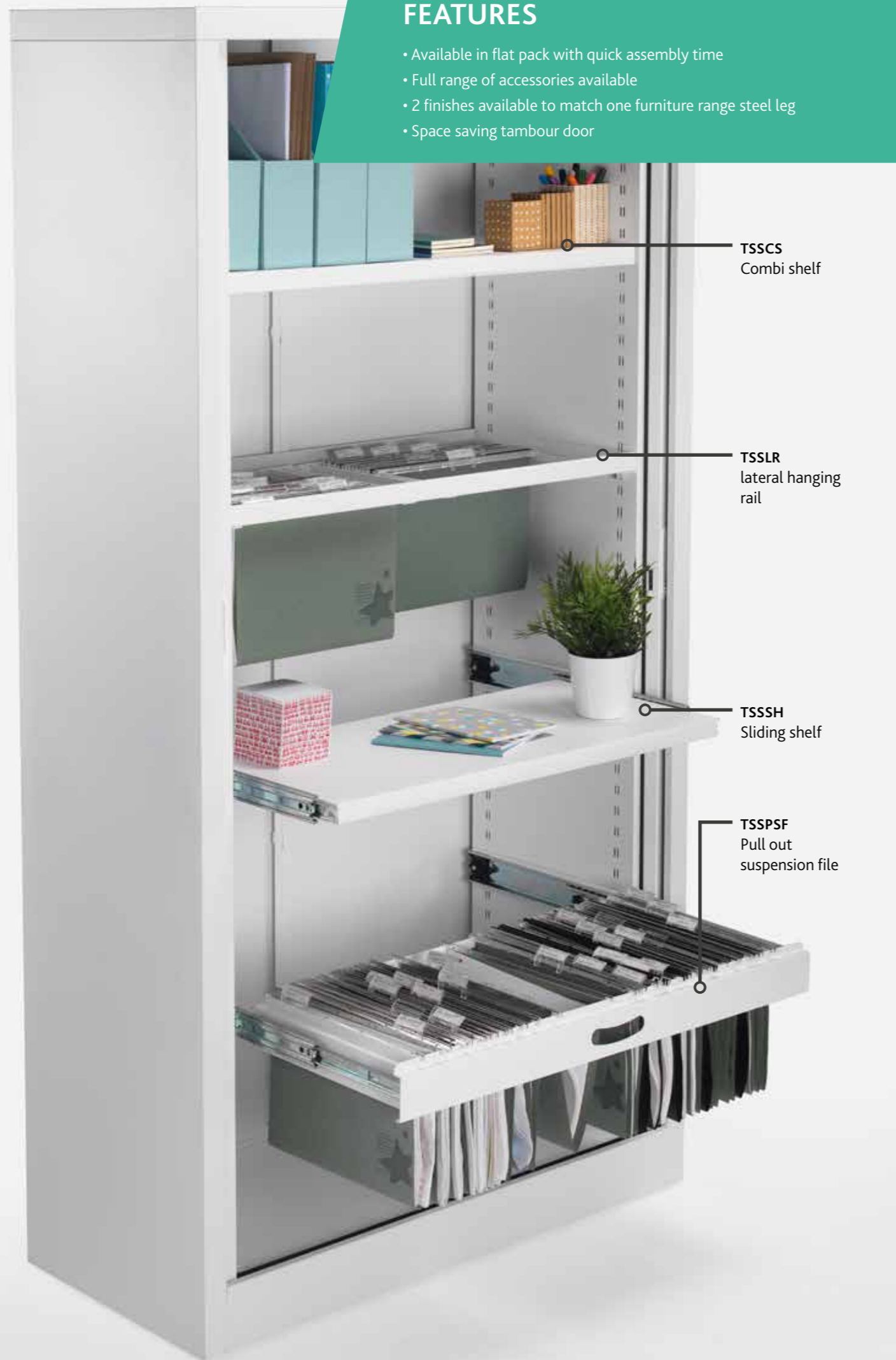
TSSCS Combi shelf